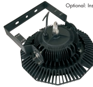
Optional: Installation bracket Part N°: BCBRACKEVO2N