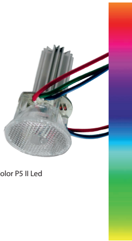
Full Color P5 II Led